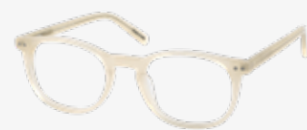
Eyecon - White Sand FL12850