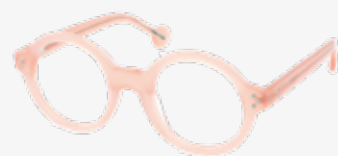
Eyeglobe - Paris in Bloom FL15055