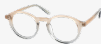
EyeFresh - Island Fantasy FL21300