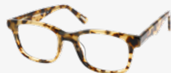
Eyequarium - Greyvanna FL14100