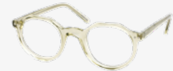
Eycube - Planet First FL17750