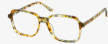
Eyewitness - Sunny Bergamot FL20500