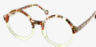
Eyecontact - Flower Flirt FL19250