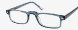
Eyespy - Hazy Harbor FL16700