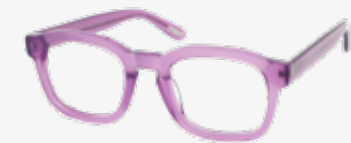
Eyecatch - Mrs Iris FL24500