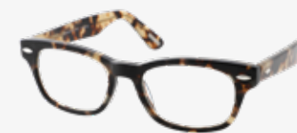
Eyebrow - Greyvanna FL1110