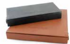
Presentation box 12 compartments