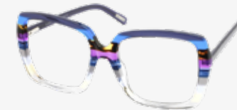
Eyedentity - Pretty Pupil FL24100