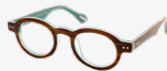
Eyeball - Root Beer FL13150